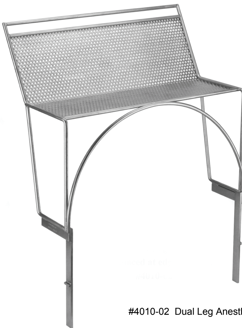
#4010-02 Dual Leg Anesthesia

Two leg mounting allows unit to be placed at edge of table.